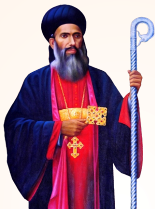
Our Patron Saint

MGM Group of Schools run by Indian (Malankara) Orthodox Church, under the Aegis of St. Thomas Mission stands in high esteem with excellent standard and best discipline. Mar Gregorios Memorial School, popularly known as MGM, is founded after Saint Mar Gregorios of Parumala, Kerala, the first Indian to be canonized as Saint. Mar Gregorios pioneered the cause of education in rural areas of Kerala.